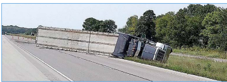
A semi-truck overturned near Burnt Prairie on Interstate 64 Monday afternoon. The vehicle damaged portions of the roadway during the accident.