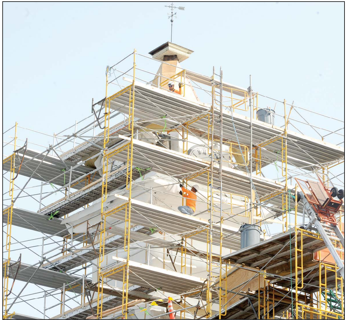
Workers with Renaissance Roofing continue their effort to restore the Edwards County Courthouse Clocktower Monday afternoon.

"What they found is much more rotting wood than what they anticipated finding," he said. "They knew they were going to find some, but there